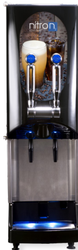
Nitro Cold Brew